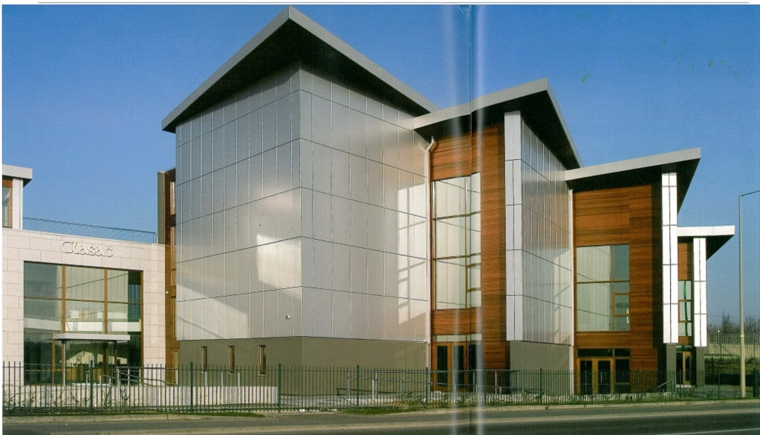
Clasac Centre for Traditional Arts

Architect: Deaton Lysaght Architects Project Size: 2055m 2 Main Contractor: Rishcon Structural & Civil Engineer: Malone O'Regan Consulting Engineers Quantity Surveyors: Duffy Gaffney Partnership